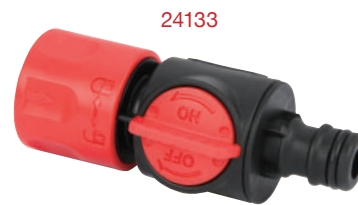
Tool-end Quick Connector w/ Manual Valve